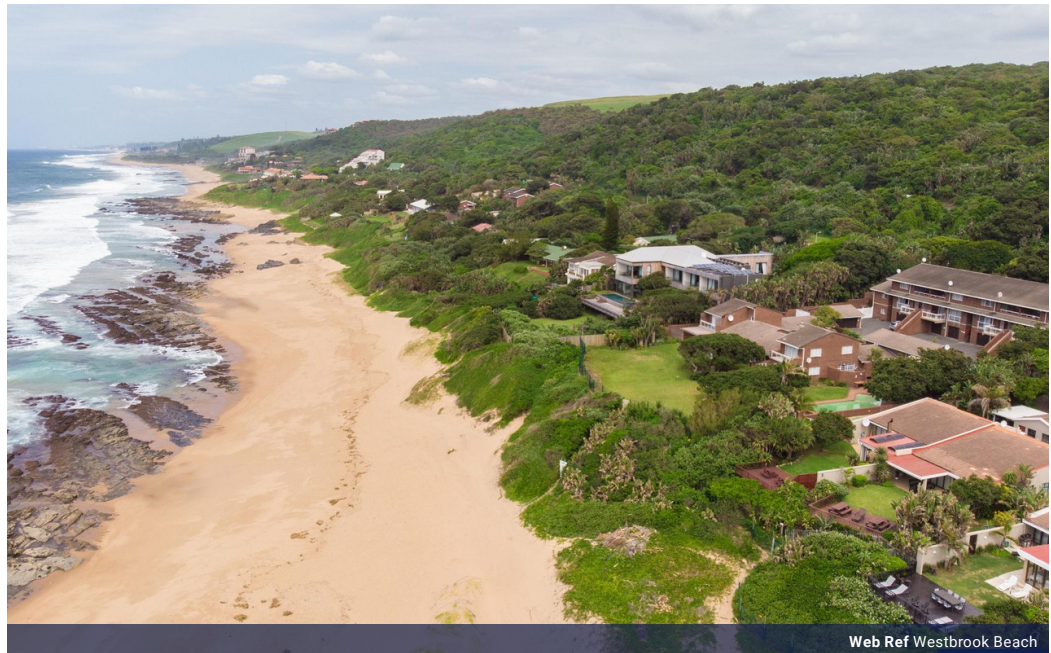
Web Ref Westbrook Beach

Seeff Zimbali & North Coast Sales Centre Nexus House, Office A Zimbali Northgate Suites Zimbali Estate, 4422